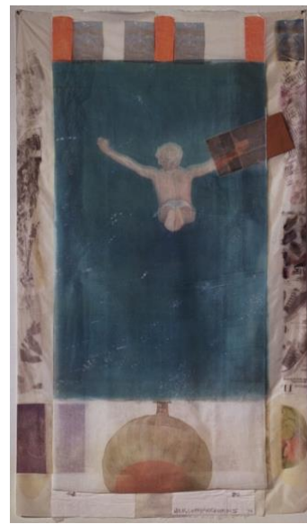
Robert Rauschenberg, Pull (Hoarfrost Editions) , 1974 215.9 x 121.9 cm (85 x 48 in.) Offset lithograph and screenprint transferred to collage of paper bags and fabric Edition of 29

LOS ANGELES, CA — Gemini G.E.L., the renowned publisher, gallery, and artists' workshop, is pleased to announce its participation in Art Basel Miami Beach from December 3–7, 2025. The booth will highlight works celebrating Robert Rauschenberg's Centennial, alongside recent editions from Thomas Demand and Toba Khedoori, and seminal works by John Baldessari, Ken Price, Richard Serra, and Frank Stella. A participant since 2003, Gemini's 2025 presentation brings together landmark collaborations and new editions that chart Gemini's enduring legacy of innovation in printmaking and editioned sculpture. This presentation reflects six decades of artistic collaboration and offers a preview of exhibitions planned for Gemini G.E.L.'s 60 th anniversary in 2026.